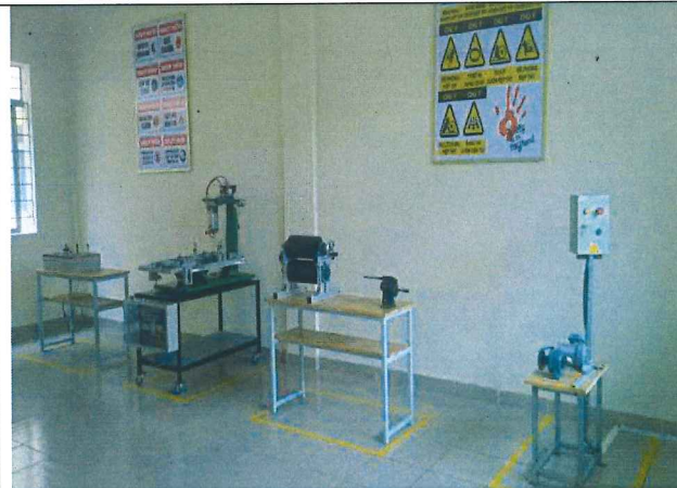
Safety experience workshop