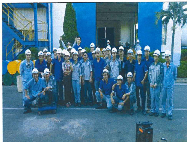
Working safety training course for enterprises