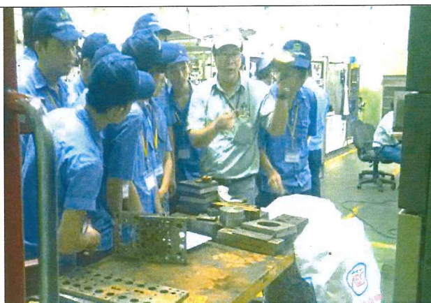
Students' practical learning at HIROTA company