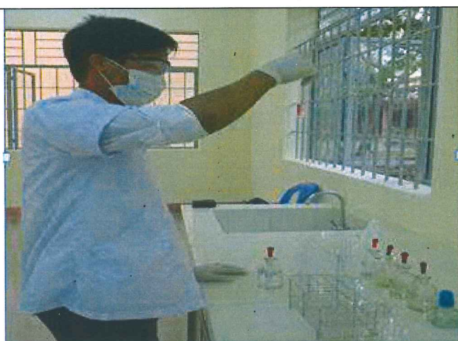
Chemical safety training course for enterprises