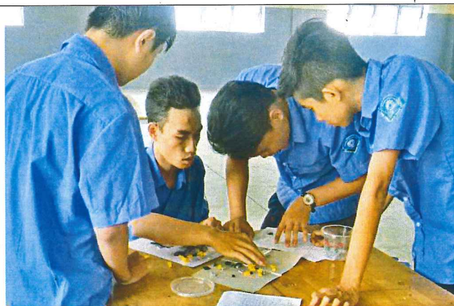
Students experienced 3S with games